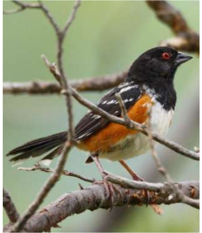
Spotted Towhee/Dane Adams