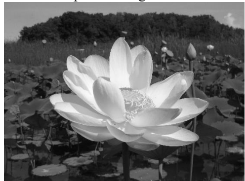
Water lotus

As expected on a fall hike, the late summer flowers were also noteworthy, especially the purple asters and yellow goldenrods. One non-composite drew some attention as well . . . a blooming smooth false foxglove. Lovely. Following this rewarding walk, several BRAS members then attended this year’s Lake Erie Wing Watch