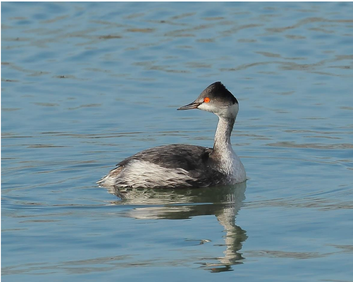
EARED GREBE