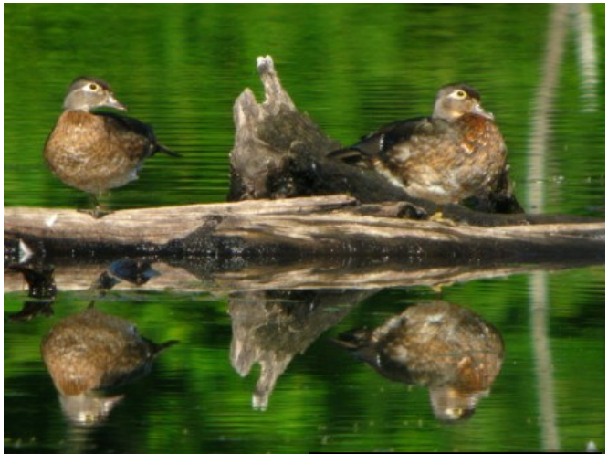
Female Wood Ducks Dane Adams