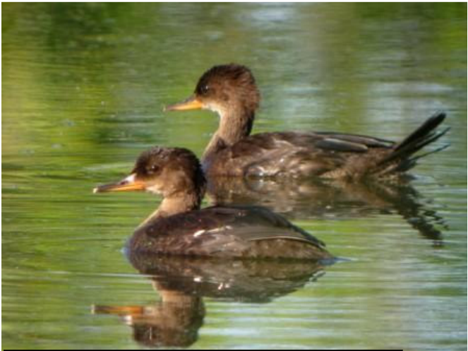
Female Hooded Mergansers Dane Adams