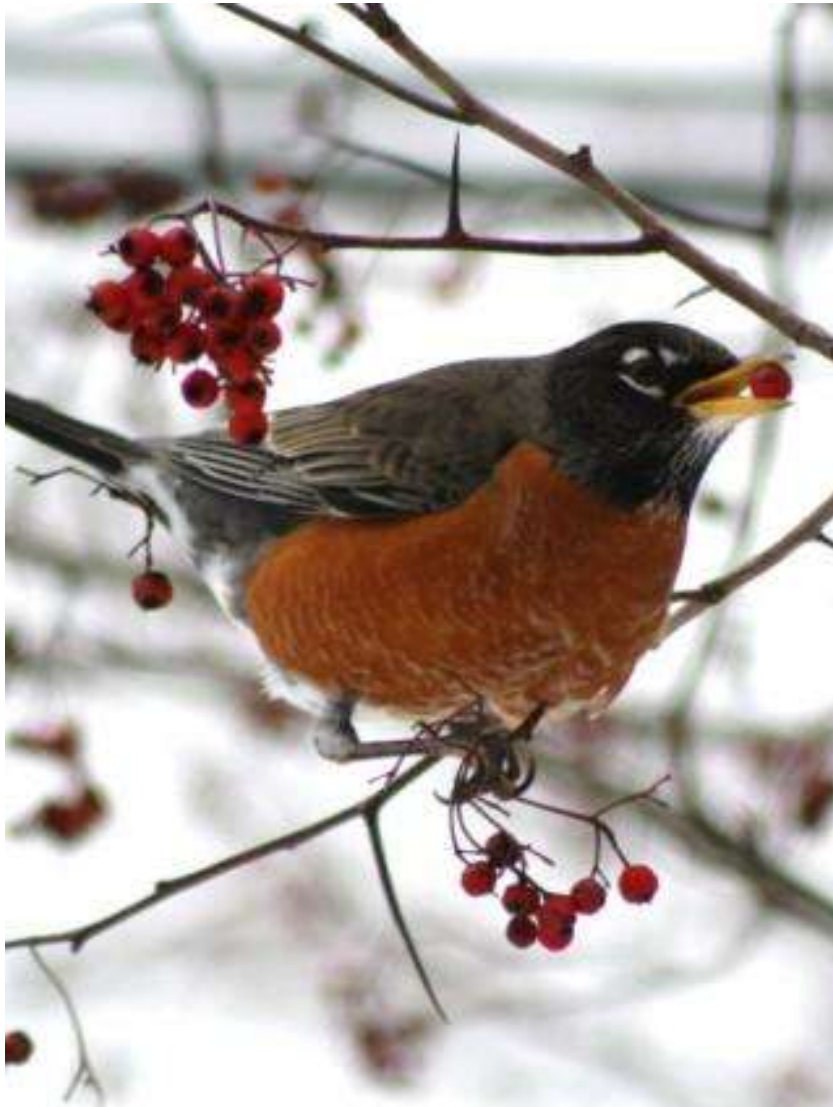
American robin Diane Devereaux

Over millions of years, certain plants have evolved into the current hawthorn shrub or tree that produces, when ripe, an orange-red berry, full of nutrients and attractive to winter robins. Robins swallow the berries whole, and the seeds in the middle of the berries goes through the digestive tracts. As a seed goes through the gizzard it may be scarified (scratching of the seed coat by gizzard-contained grit) which may improve germination when deposited with nitrogenous fertilizer usually distant from the hawthorn plant. If the fruit simply fell to the ground below the tree, the germinated seed might be too shaded to survive. But hawthorns and other organisms have evolved another propagation mechanism.