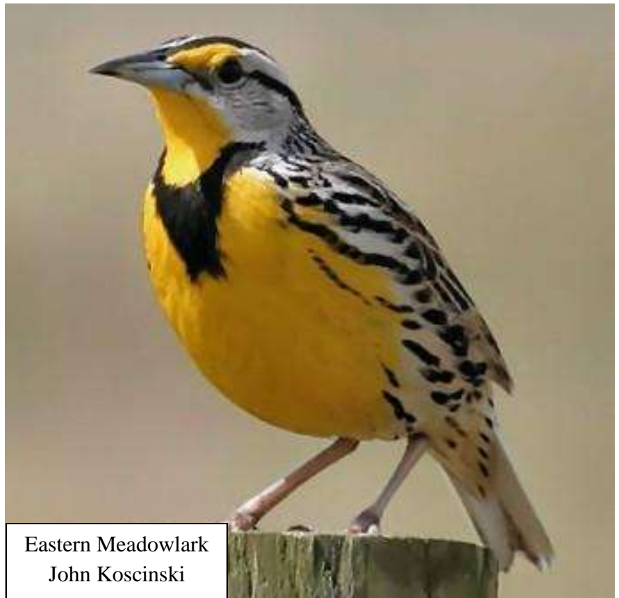
Eastern Meadowlark John Koscinski

Northern rough-winged swallow, purple martin, tree swallow, bank swallow, barn swallow, cliff swallow, black-capped chickadee, tufted titmouse, white-breasted nuthatch, Carolina wren, house wren, marsh wren, blue-gray gnatcatcher, ruby-crowned kinglet,