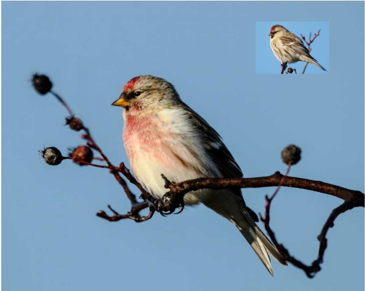
MALE & FEMALE COMMON REDPOLL