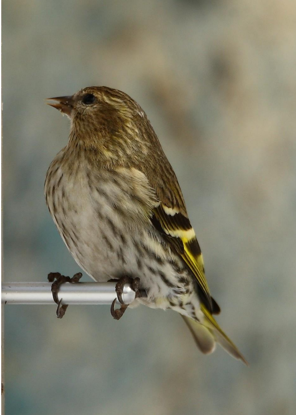
PINE SISKIN

Note: The Alpha Code is called more accurately the American Ornithologists' Union Band Code.