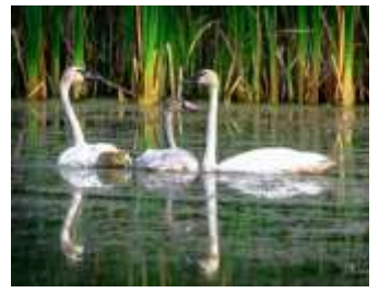
TRUPETER SWAN