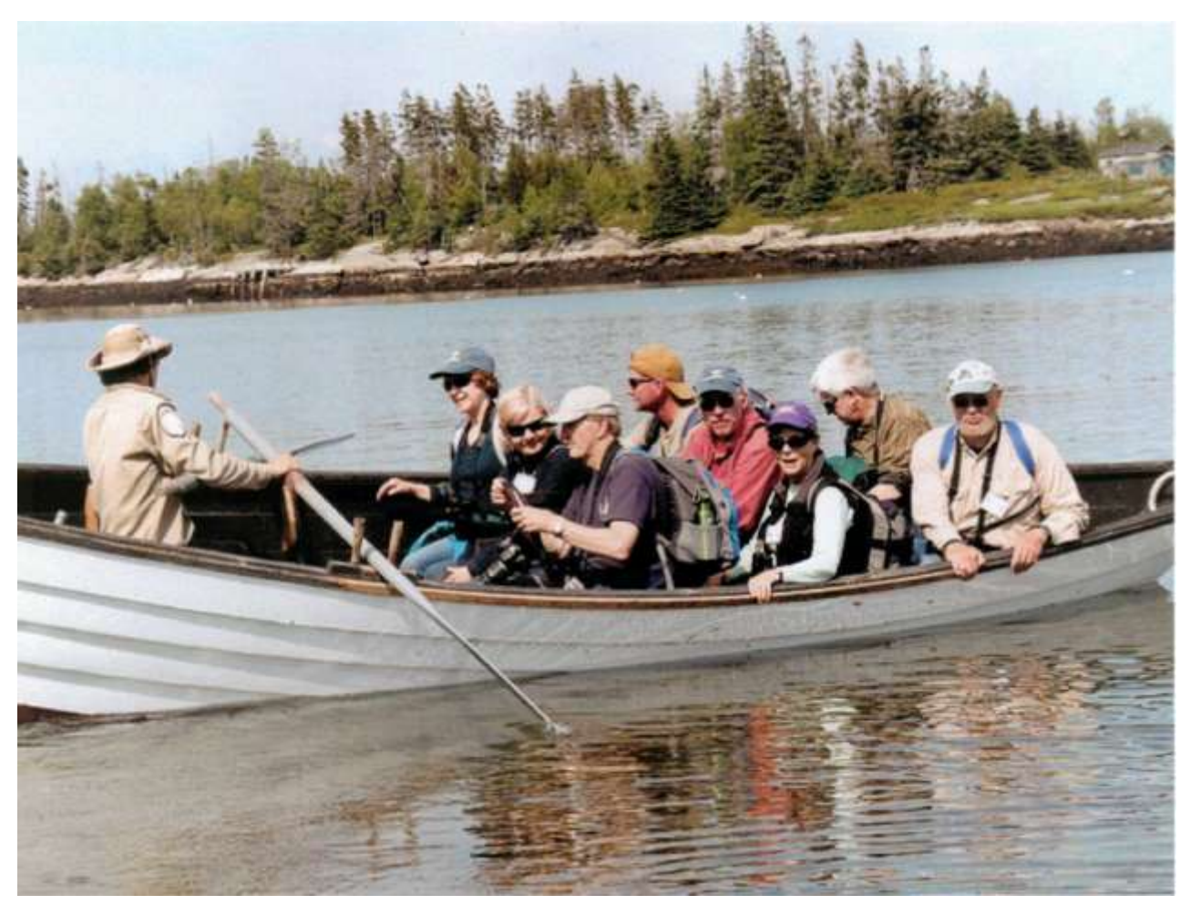
Hog Island Summer Camp 2011

We always enjoy learning from the campers as they pass on what they've learned to those who attend our chapter field trips.