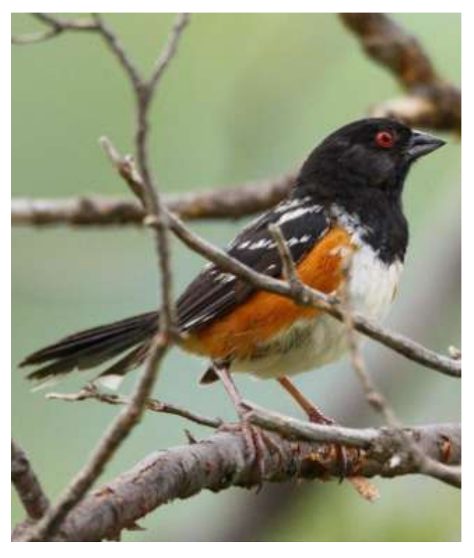
Spotted Towhee/Dane Adams