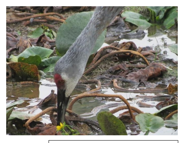
SANDHILL CRANE

We finished with 27 species that day, not bad for a hike that started out so dark and dreary. The species were blue jay, kingfisher, European starling, mourning dove, red-bellied woodpecker, chimney swift, great egret, great blue heron, mallard, wood duck, bald eagle, killdeer, lesser yellowlegs, sandhill crane, American goldfinch, song sparrow, green winged teal, Canada goose, tufted titmouse, northern cardinal, northern rough-winged swallow, American kestrel, tress swallow, eastern wood-pewee, northern flicker, black-capped chickadee, house sparrow.