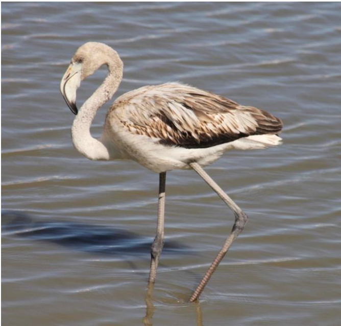
Greater Flamingo Juvenile, 2-3 years

Wingtips writer and photographer, Barbara Baudot, took these and the front cover photo in Le carmarque, France, during a September 2019 outing.