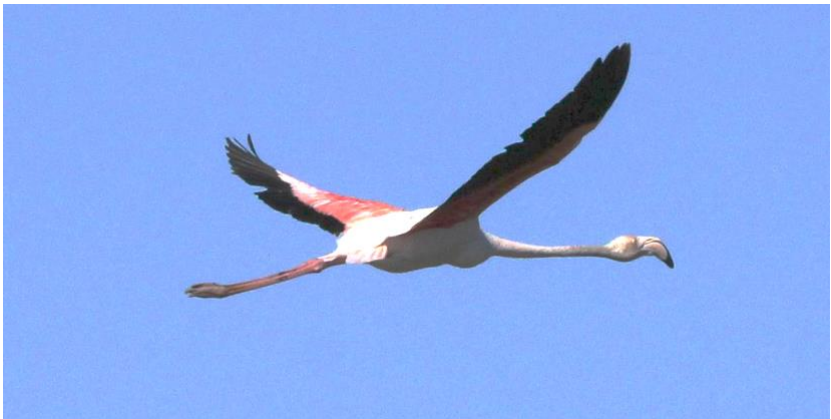
Greater Flamingo Adult in Flight

Wingtips writer and photographer, Barbara Baudot, took these and the front cover photo in Le carmarque, France, during a September 2019 outing.