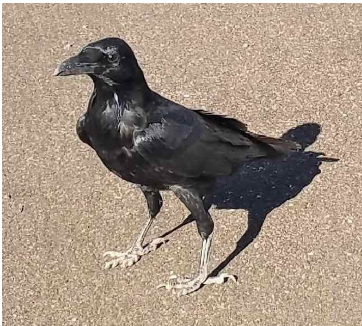
COMMON RAVEN