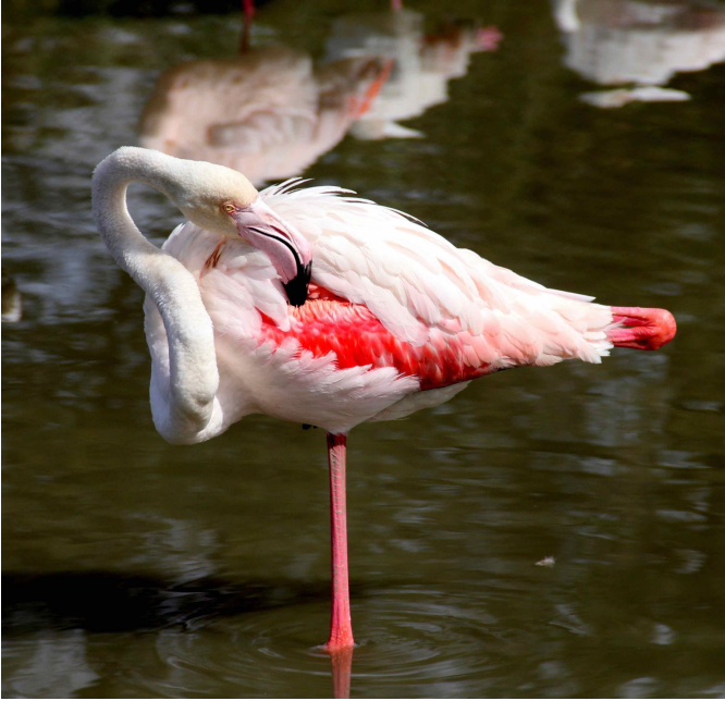
GREATER FLAMINGO