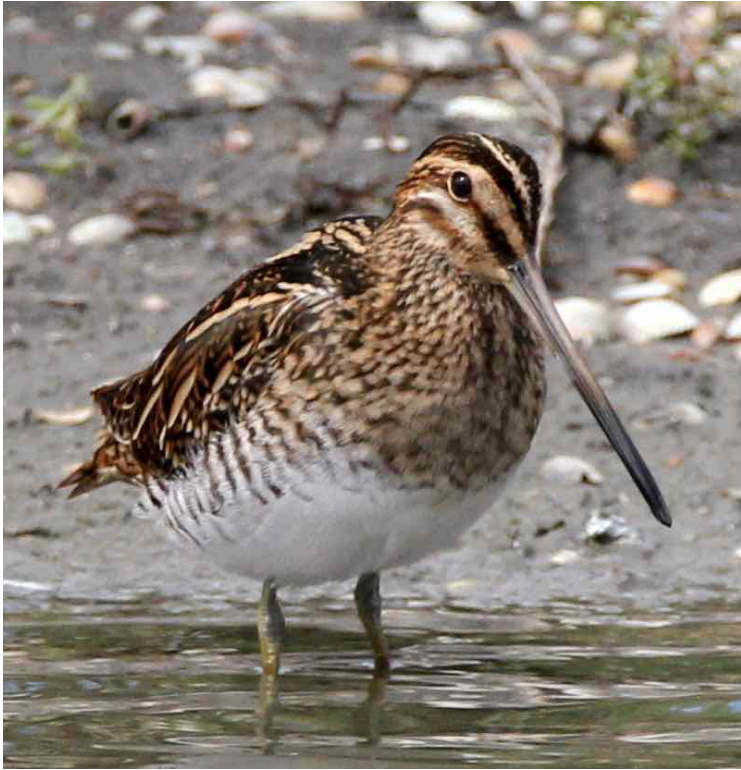
COMMON SNIPE