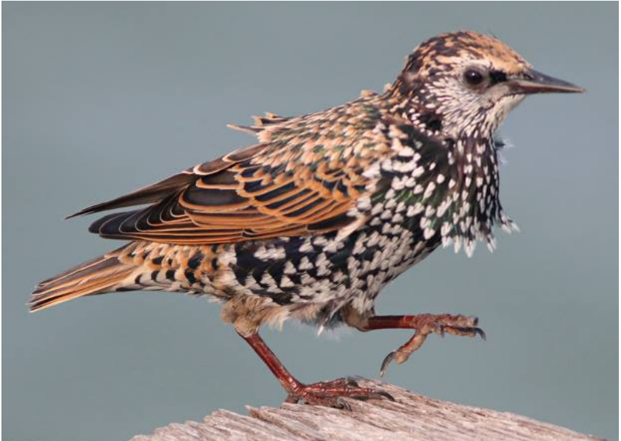
EUROPEAN STARLING