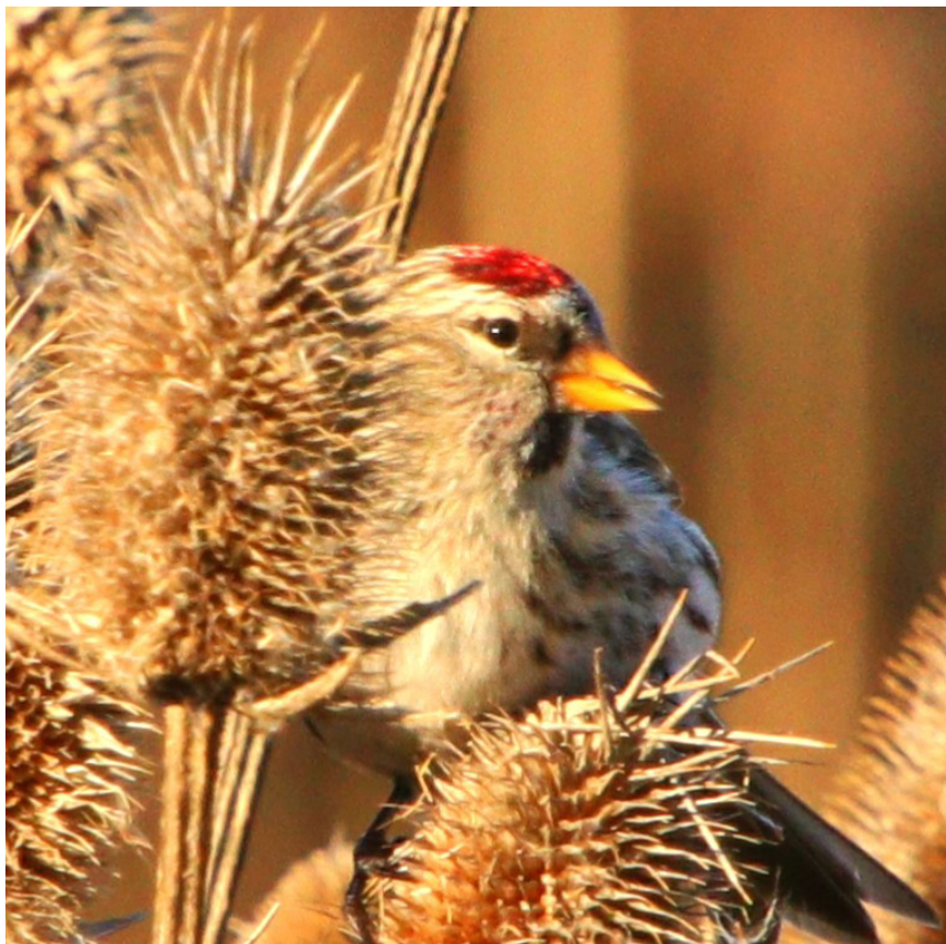
COMMON REDPOLL