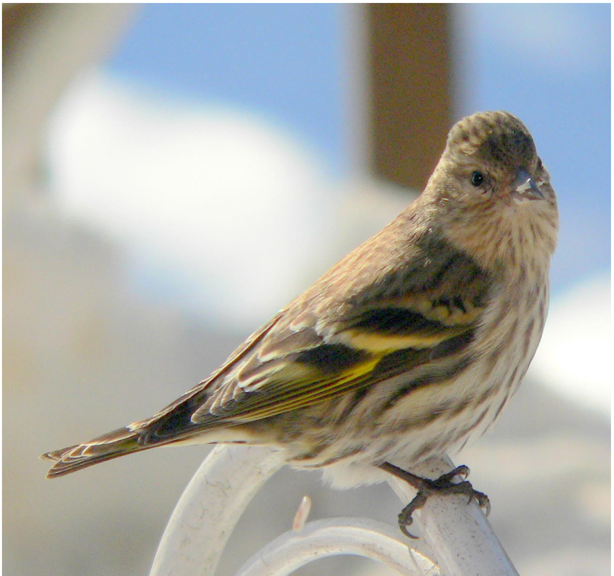
PINE SISKIN