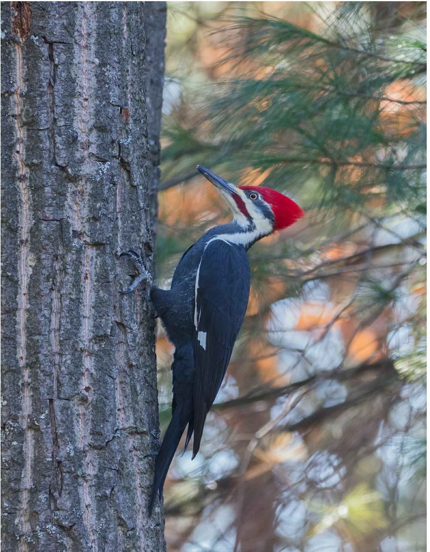
PILEATED WOODPECKER