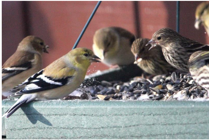
AMERICAN GOLDFINCHES AND PINE SISKINS