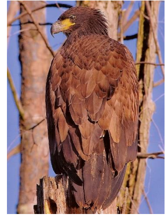
JUVENILE BALD EAGLE