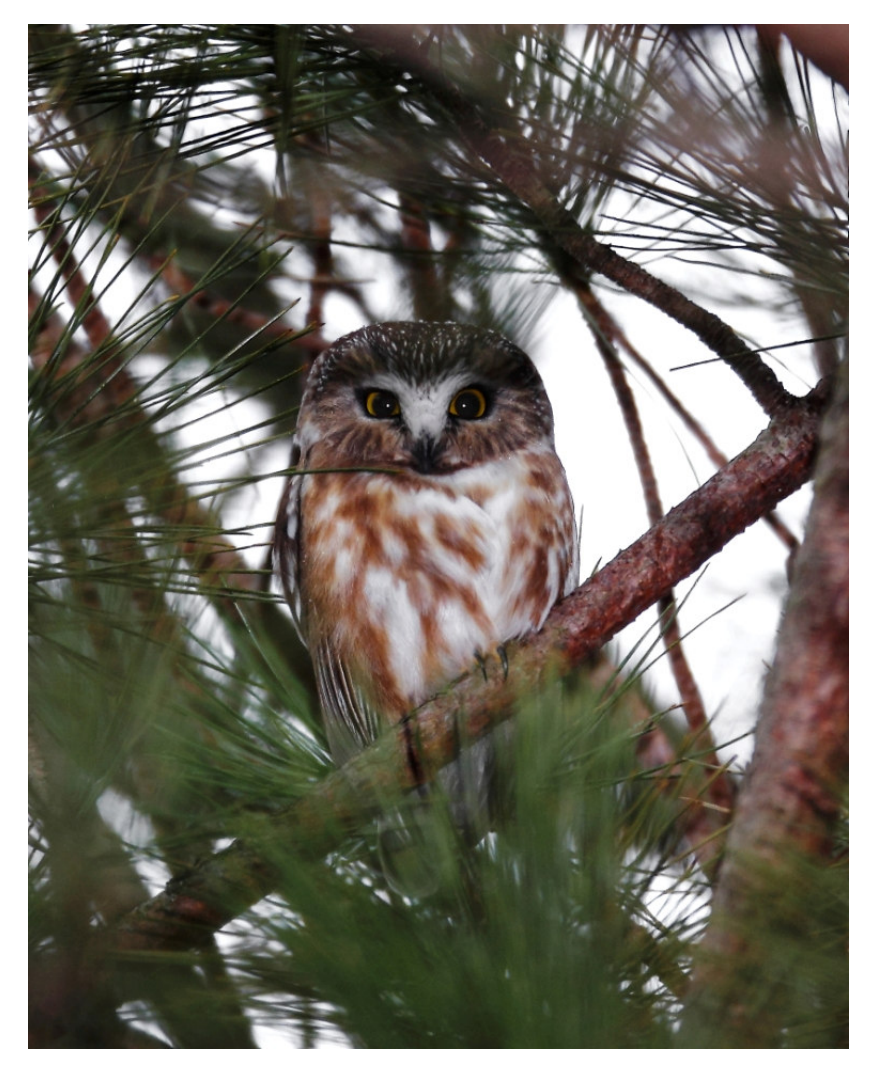
NORTHERN SAW-WHET OWL discovered by MIKE SMITH

GROSBEAK, BLUE GROSBEAK, INDIGO BUNTING, DICKCISSEL, BOBOLINK, RED-WINGED BLACKBIRD, EASTERN MEADOWLARK, RUSTY BLACKBIRD, COMMON GRACKLE, BROWN-HEADED COWBIRD, ORCHARD ORIOLE, BALTIMORE ORIOLE, PURPLE FINCH, HOUSE FINCH, RED CROSSBILL. WHITE-WINGED CROSSBILL, COMMON REDPOLL, PINE SISKIN, AMERICAN GOLDFINCH, HOUSE SPARROW.