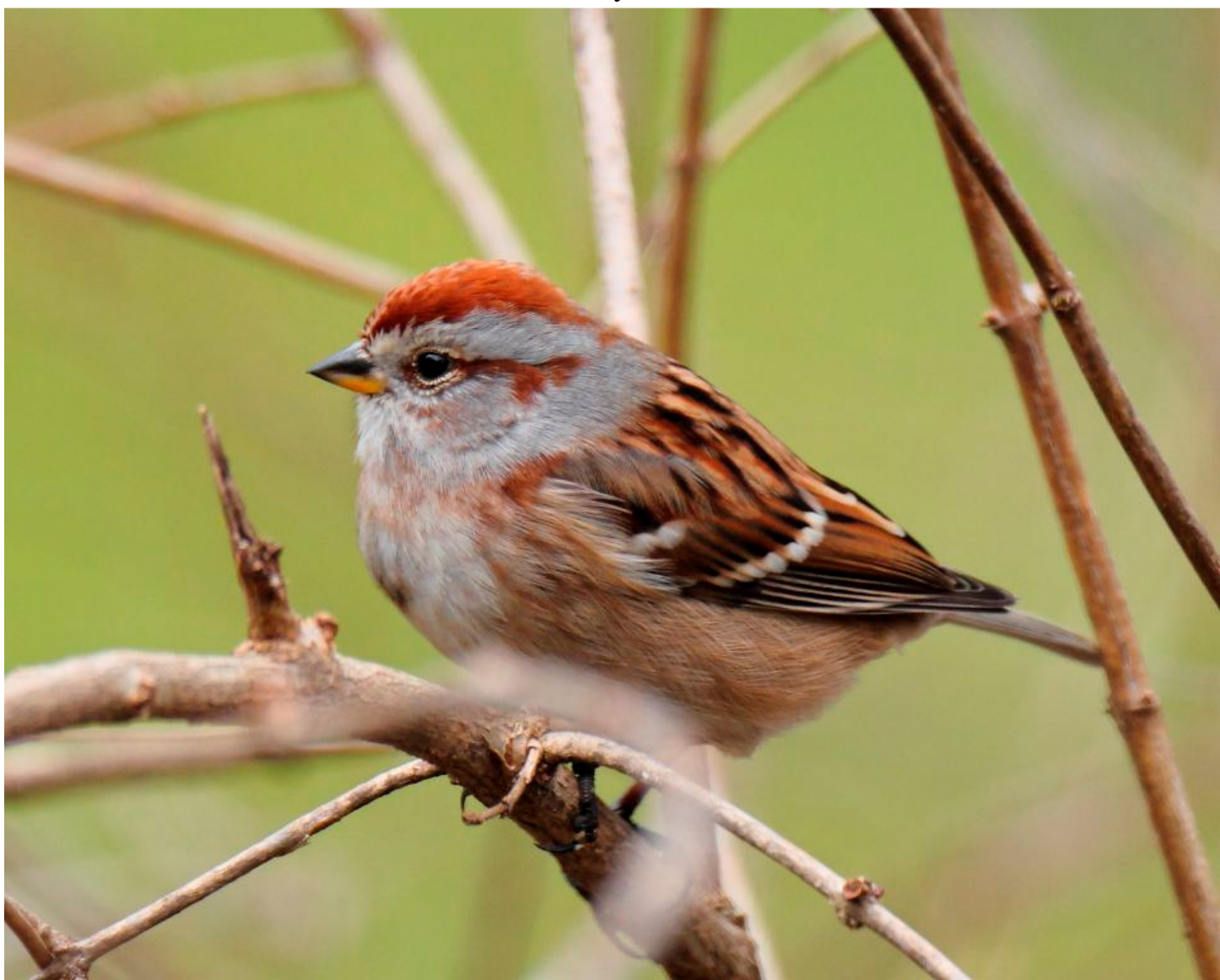
AMERICAN TREE SPARROW