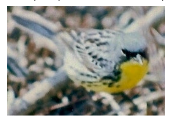
Kirtland's Warbler

weren't so fussy about their breeding habitat – they nest beneath young jack pine trees (5 to 18 feet tall). If the trees are too young, the branches are too low, and if the trees are too old, the branches are too high – so the sanctuary is managed by burning trees to maintain enough of the right age at all times. If you think they have a difficult time during the breeding season, keep in mind that they spend the winter in the Bahamas. I have never felt the need to go to the Michigan breeding grounds (After all the birds stop here in Ohio.), but I wouldn't be averse to visiting them in the Bahamas some winter!