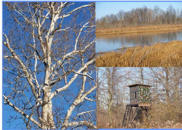
November Trail Sights