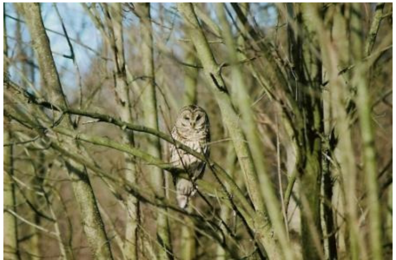
Barred Owl Pat Ives Carlisle Reservation November 2009