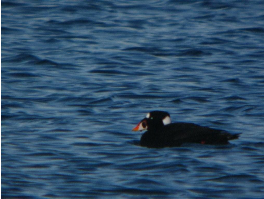
Surf Scoter Dane Adams Wellington Upground Reservoir November 2009