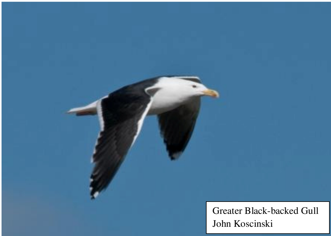
Greater Black-backed Gull