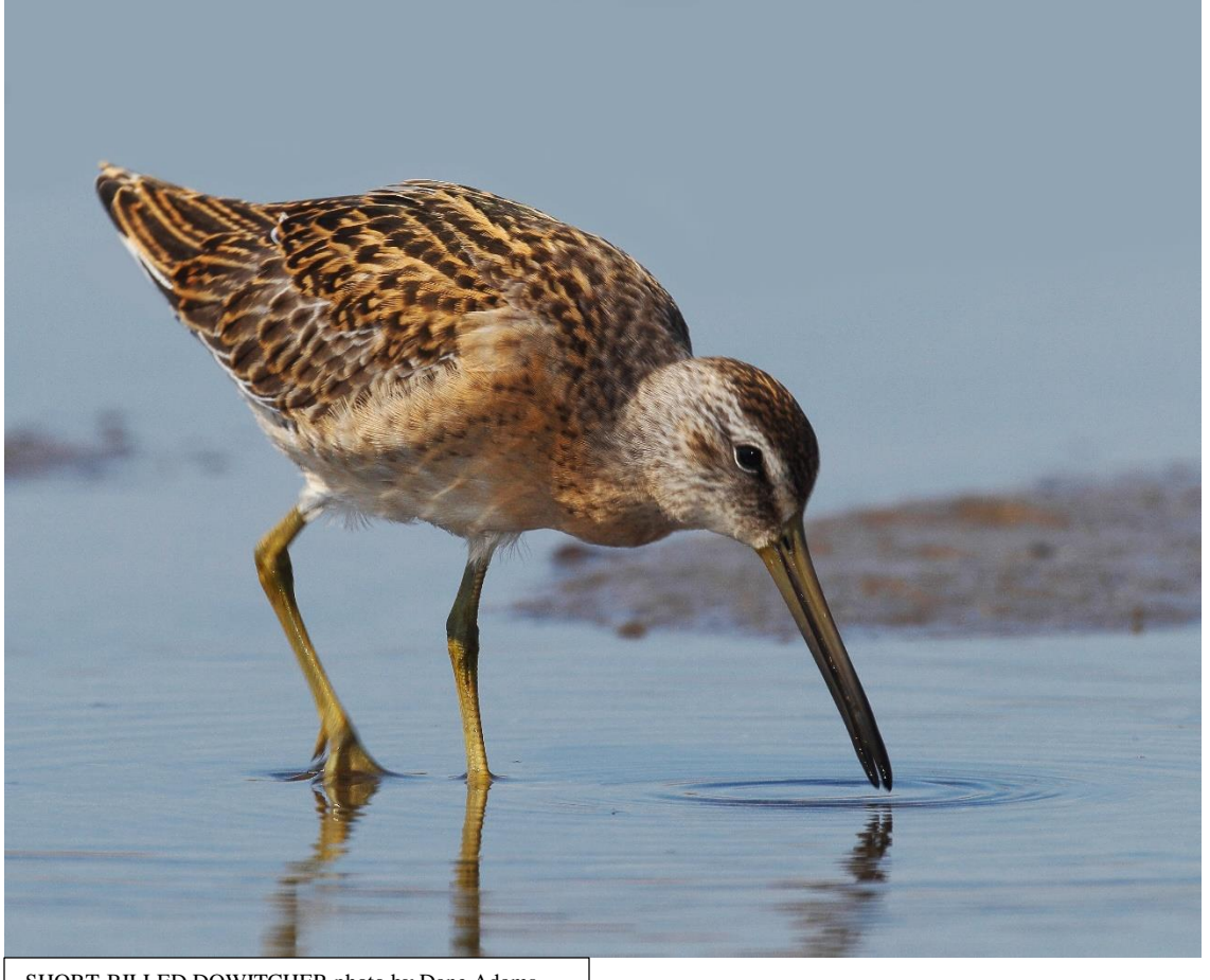
SHORT-BILLED DOWITCHER

Perhaps the first way to determine an ID of this species (short or long) is to observe its behavior. Both species probe shallow water with rapid "sewing machine-like" strokes. A clue to determining the difference between the two is that the long-billed has a much darker breast in its breeding plumage. According to Larry Rosche. author Birds of the Cleveland Region, vocalizations are the best way to determine an especially dealing individuals in juvenile plumages. Needless to