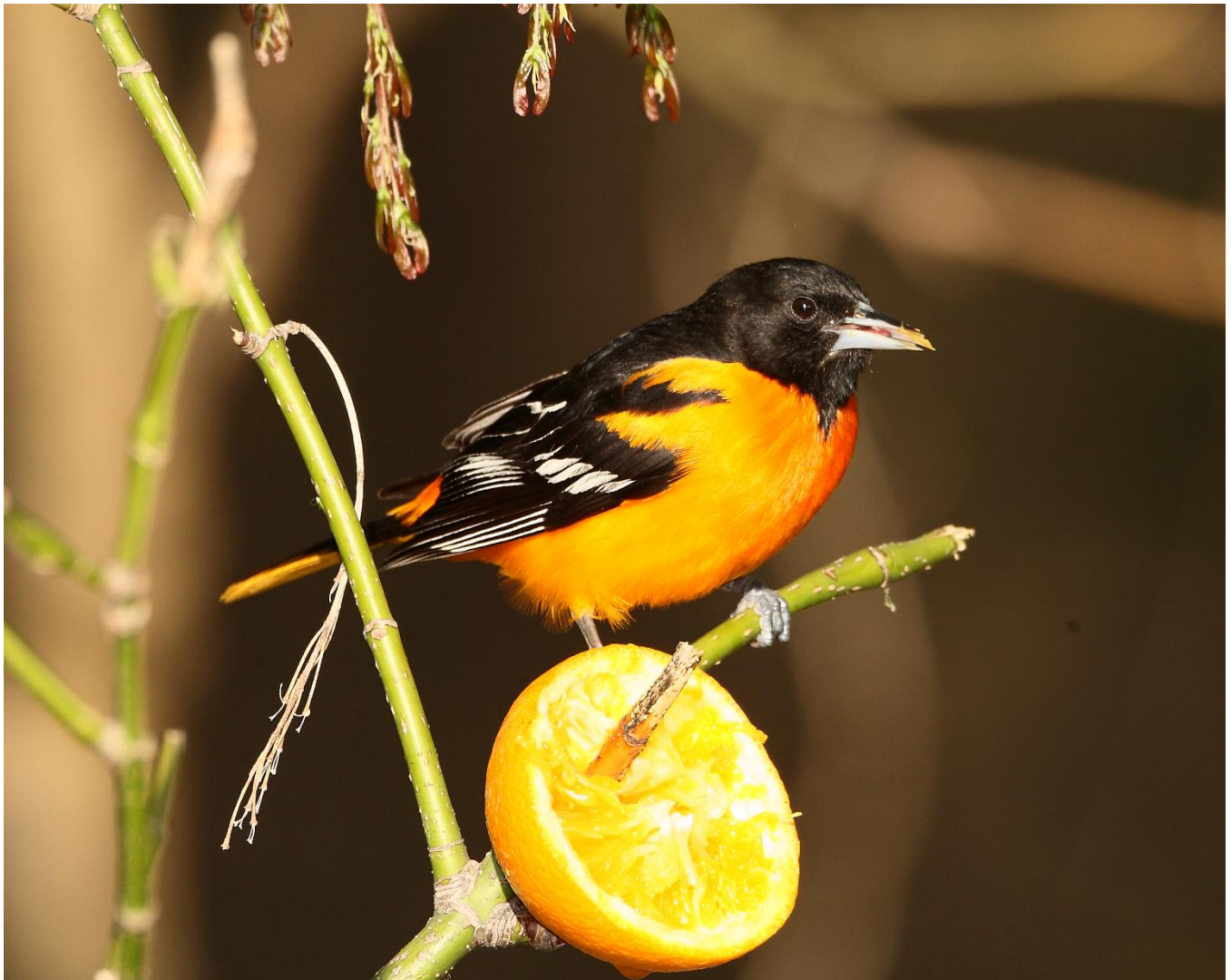
BALTIMORE ORIOLE