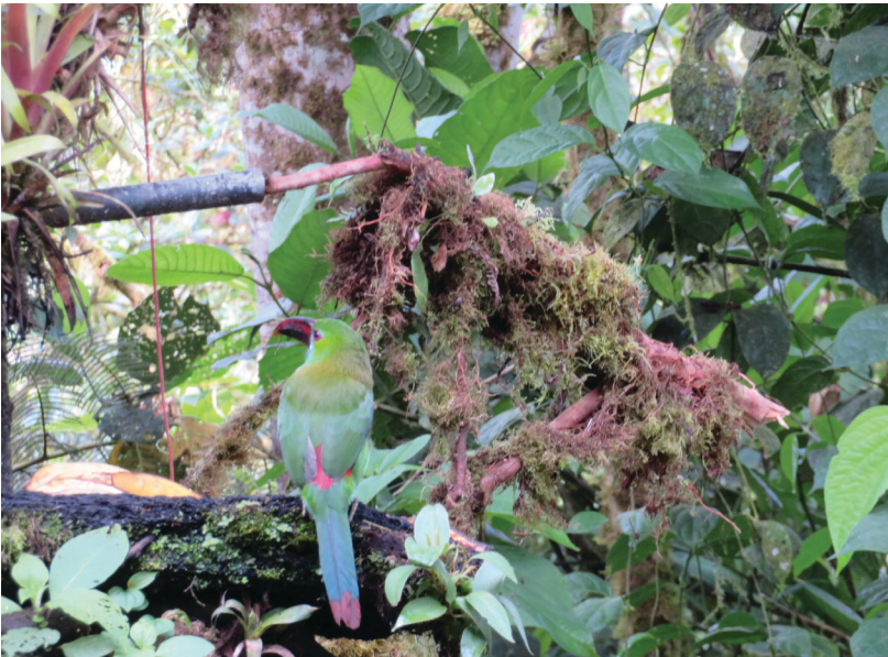
Rumped Toucanet

After leaving the hummingbird farm we traveled to the national park where we took a cable car ride up the side of a mountain. It was amazing to look down and see the lush rain forest vegetation with orchids and bromeliads growing in the crotch of the trees. Our next stop was in the town of Mindo where we visited a butterfly farm and a cocoa processing plant. The cocoa process deserves a separate article by itself. While at these two locations we got to see more birds, including a Bananaquit and Thick-billed Euphonia. If you get the chance to take a trip to Ecuador it would be well worth your while. Just plan on staying more than the week that we spent there!