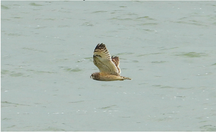
A Short-eared Owl flying along Lake Erie at the Lorain Impoundment

When I first started birding, I drove all the way out to Killdeer Plains to try to see my first Short-eared Owl. Killdeer Plains is a place people drive around rather than walking, so it isn't my favorite kind of birding, but after many laps I finally saw a Short-eared Owl perching on a small tree! I was ecstatic! Then when I came back various birders told me “Hey Dummy, you can see them in Lorain County!”. Oh.