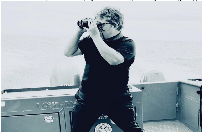
JB scanning for jaegers on a Lake Erie pelagic

"The Presence (and Presents) of Birds — a lifetime of chasing wings"