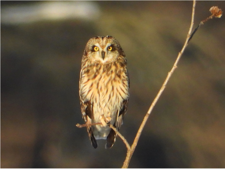
SHORT-EARED OWL