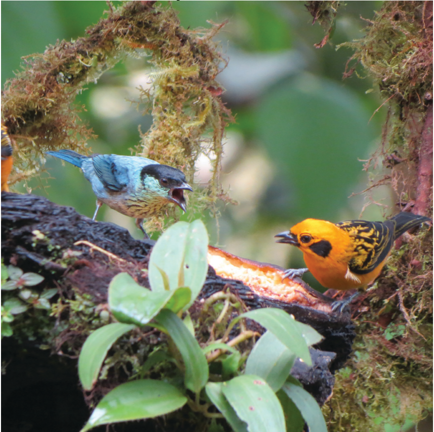
Black-capped Tanager and Golden Tanager