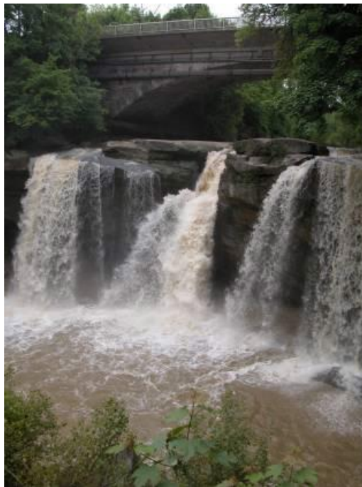
West Falls of the Black River in Elyria, Ohio, height=35feet